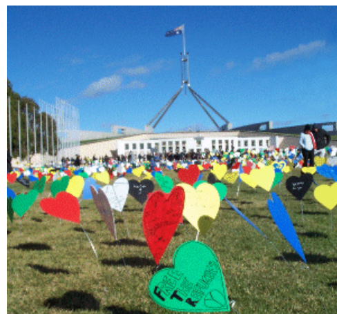
'Field of Hearts' in Canberra, World Refugee Day 2004.

RCOA is the national umbrella advocacy body working on refugee issues in Australia. All information relating to Refugee Week 2010 will be posted on the Council's website as it becomes available and will include a poster to download, a Calendar of Events which will be updated regularly, and other information to assist community groups and others in their planning for Refugee Week 2010.